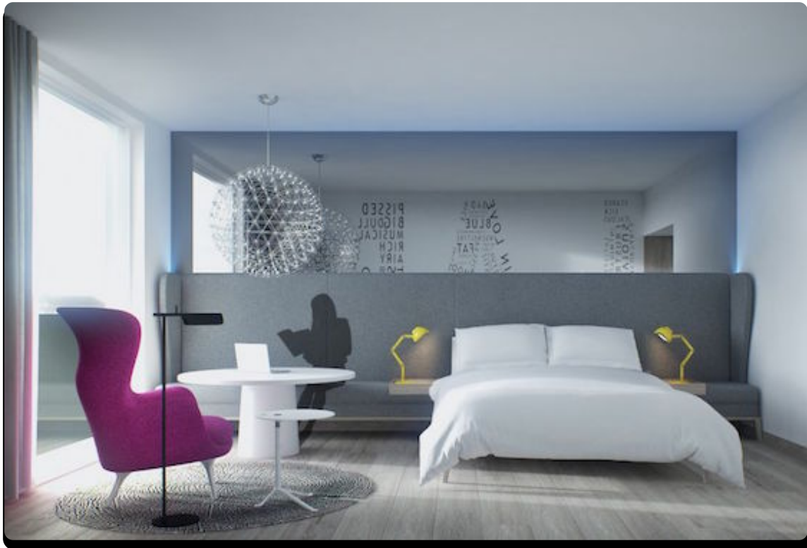
Another version of a guestroom