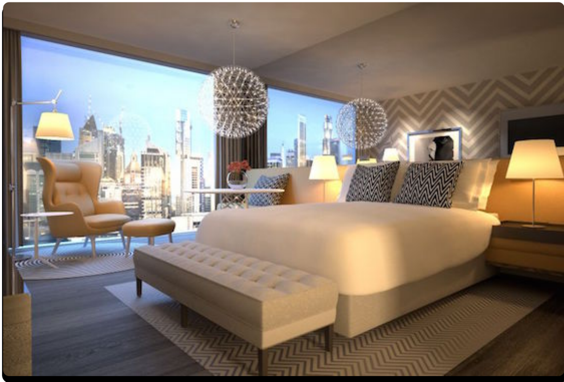
A BluPrint option for a "business class" guestroom